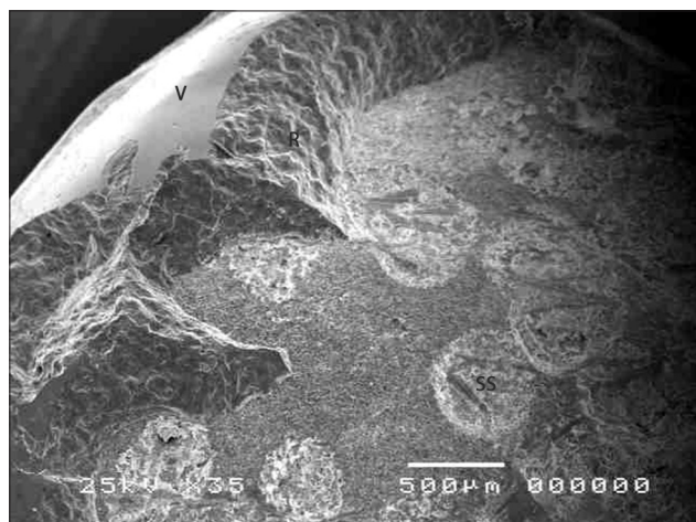
Figure 3: Veneer debonding: Spot size (SS) of about 0.5 mm corresponding approximately to the diameter of the laser sapphire tip