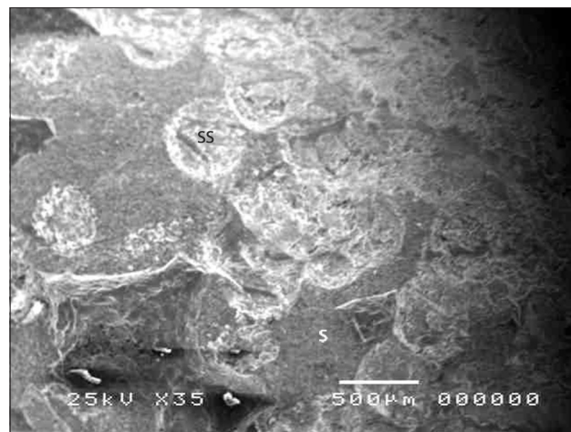
Figure 2: Broken veneer (V), sealer (S), and spot size (SS) on tooth surface