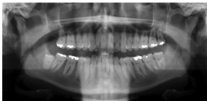
Fig. 1. Orthopantomogram. The left mandibular ascending ramus is very close to the erupted teeth 2.8 and 3.8. The lack of space around the two teeth could originate gingival chronic inflammation because of difficult daily oral care. The close vicinity between semi-included tooth 4.8 and the mandibular ramus of the trigeminal nerve can generate sensory input to the nervous system by mechanical pressure, and its partial eruption can generate a chronic gingival inflammation.

We report on a fifty-year-old man who had been suffering from increasing neck pain, burning, and stinging since he was 18 years old. Rotation of the cervical spine to the left or right increased the pain up to a peak level of 6 on the Visual Analog Scale (VAS). Sitting (at the computer) was worst.